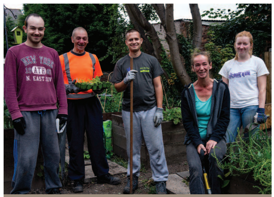
Volunteers from the community preparing a property to be let in Hull, UK.

The long term goal of the project is to help shape and influence the infrastructure which supports and delivers community-led housing in England so that more people are able to access it. BSHF is working with a wide range of organisations and individuals to share positive practice, raise awareness, build and strengthen capacity and create lasting change.