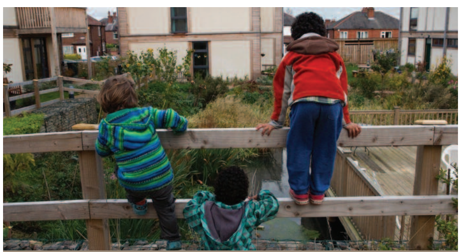
Lilac (Low Impact Living Affordable Community), UK Lilac is a self-planned and managed co-housing community in Leeds, England, which has at its heart a strong focus on living sustainably and communally.

Through a programme - funded by the Nationwide Foundation - BSHF is focused on building momentum for community-led housing in England, but also on developing networks for knowledge sharing and exchange across Wales, Scotland, Northern Ireland and beyond.