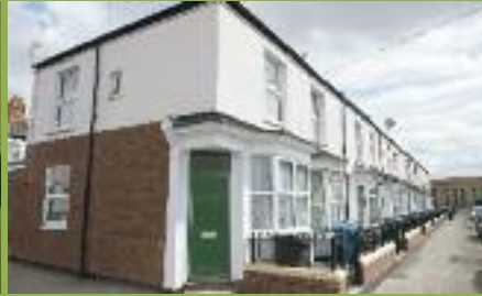
One of Giroscope's completed homes