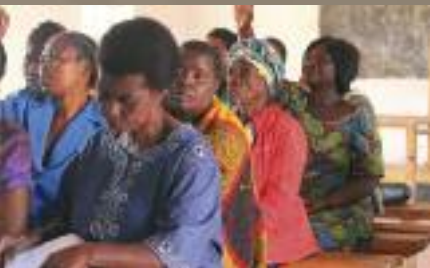
Community Development Strategy meeting in Mzuzu