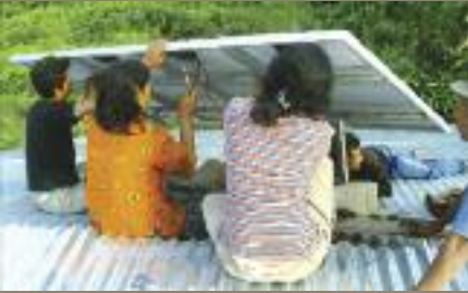
Installing solar home lighting systems