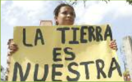
"It's our land"