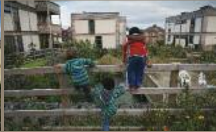
Shared central space with sustainable urban drainage pond