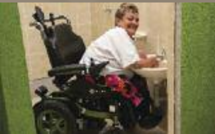
Accessible bathroom giving more independence