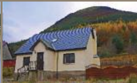
Glenachulish, a village near Fort William