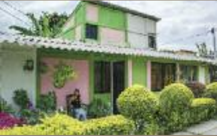
A house from Nashira's first stage of development