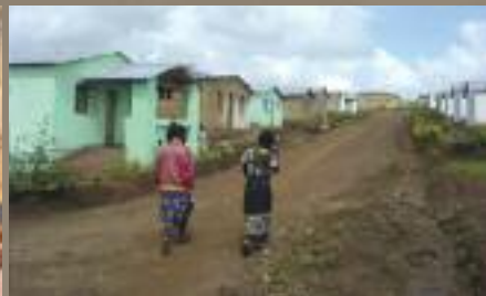
Cooperative Housing in Angelo Goveya