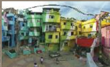
Santa Marta: 34 connected buildings