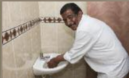
Using new basin facilities