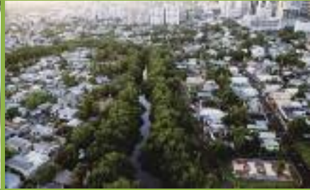
San Juan Bay Estuary