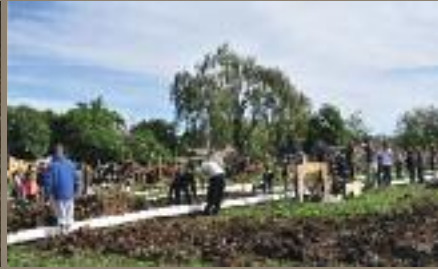
Large scale community involvement in the provision of sanitation