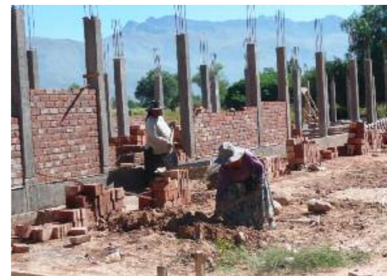
Bolivia – Mutual aid construction