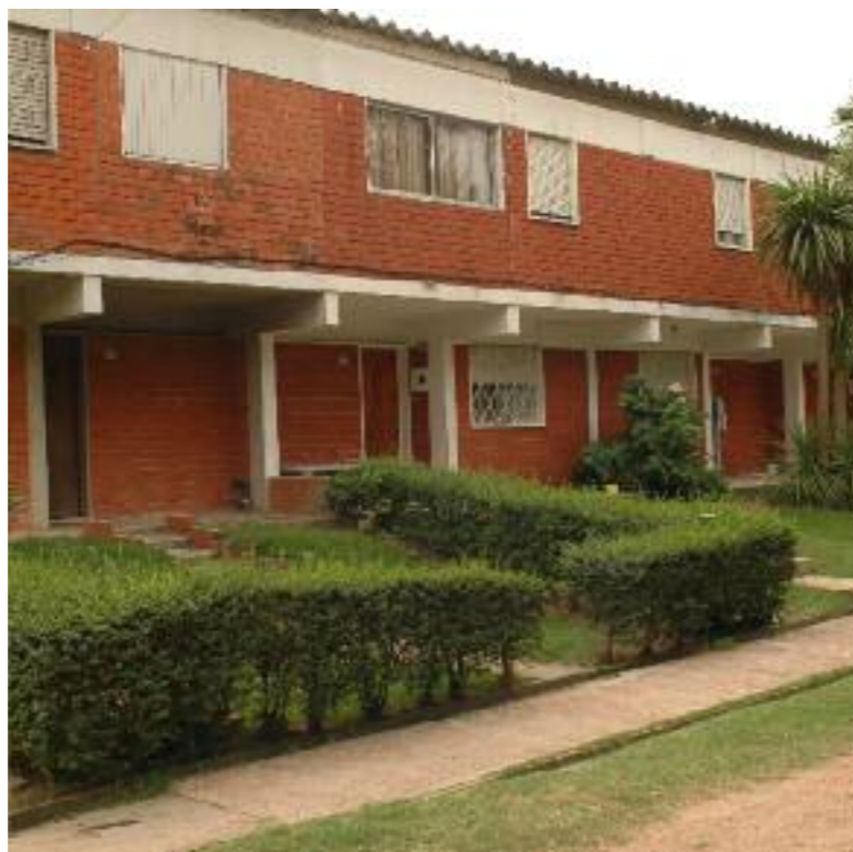
Case Studies: Zona 3

Each cooperative development built by FUCVAM members since the 1970s has its own defining history and characteristics. In fact, the housing cooperatives vary in scale, typology of housing units, access to facilities and services and location, contributing towards the creation of a diversified urban landscape. These variations are not only due to the preferences of the individual cooperatives, but also to changes in needs and resources over time, and the ability of FUCVAM's cooperatives to adapt, innovate and incorporate lessons learned. Here we provide examples of cooperative developments in Montevideo, Uruguay that were established in different periods: