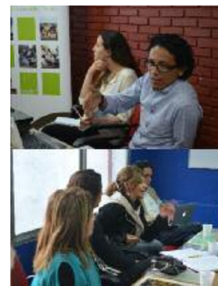
Participants engaging in discussions