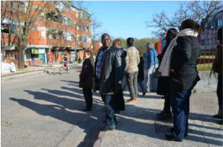
Visit to Zona 3 housing cooperatives