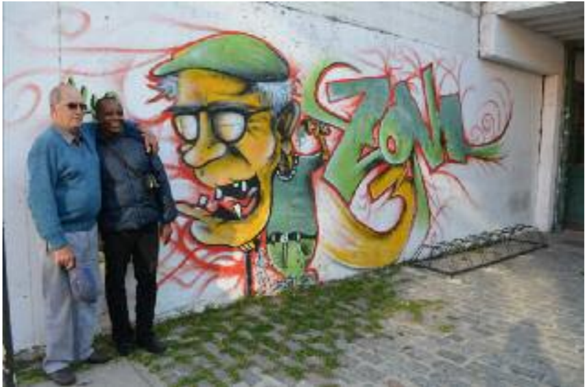
Creating bonds between participants and cooperative members