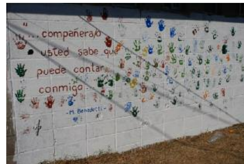
Commitment to the principle of solidarity: 'Dear friend, you know you can count on me'