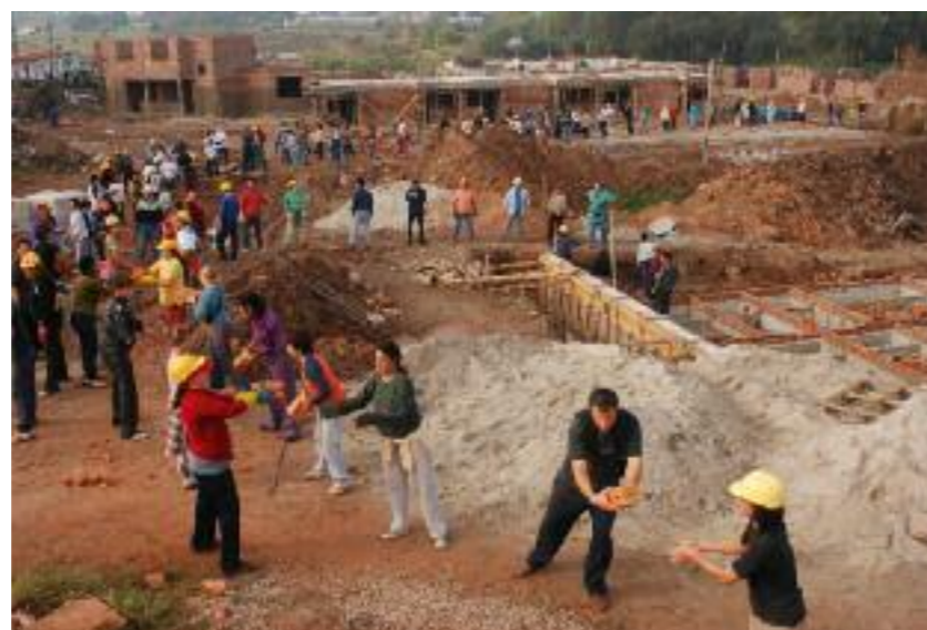
Solidarity Day reuniting FUCVAM members in support of the construction of the 23 Octobre cooperative neighbourhood