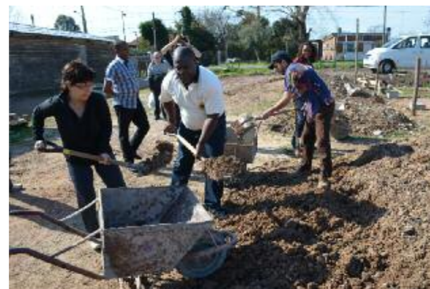
Participants rolling up their sleeves to help with the construction