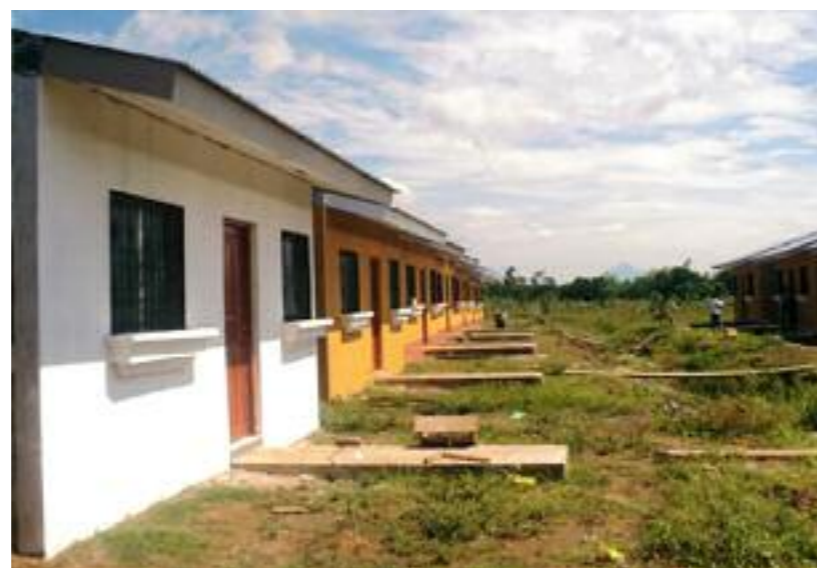
Nicaragua – Newly constructed Volcanes housing cooperative