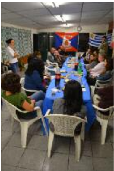
Welcome meal in the community room at the Covigu housing cooperative