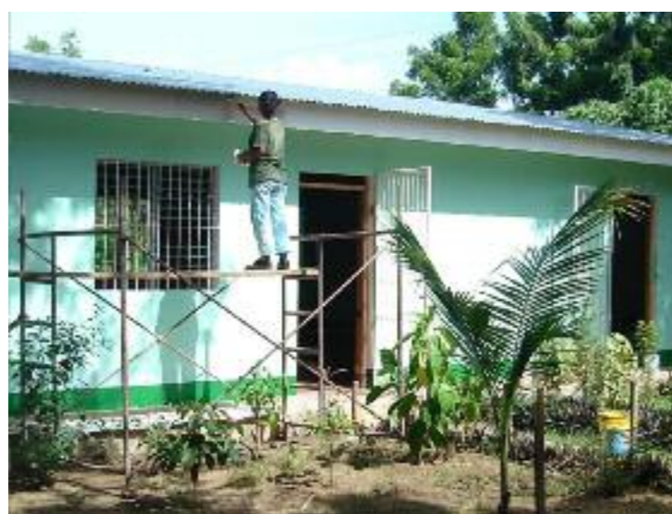
Nicaragua – Communal living area in Matiare