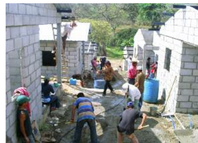
Honduras – Casa de Oro Cooperative members building their houses