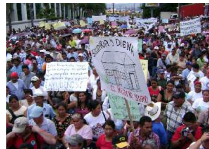
Honduras – Social mobilisation for the right to decent housing