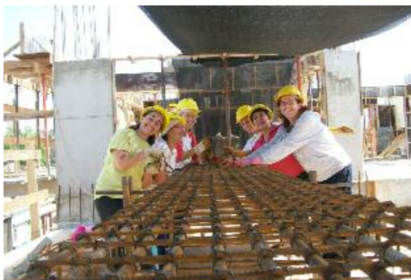
Cooperative members at work on their houses