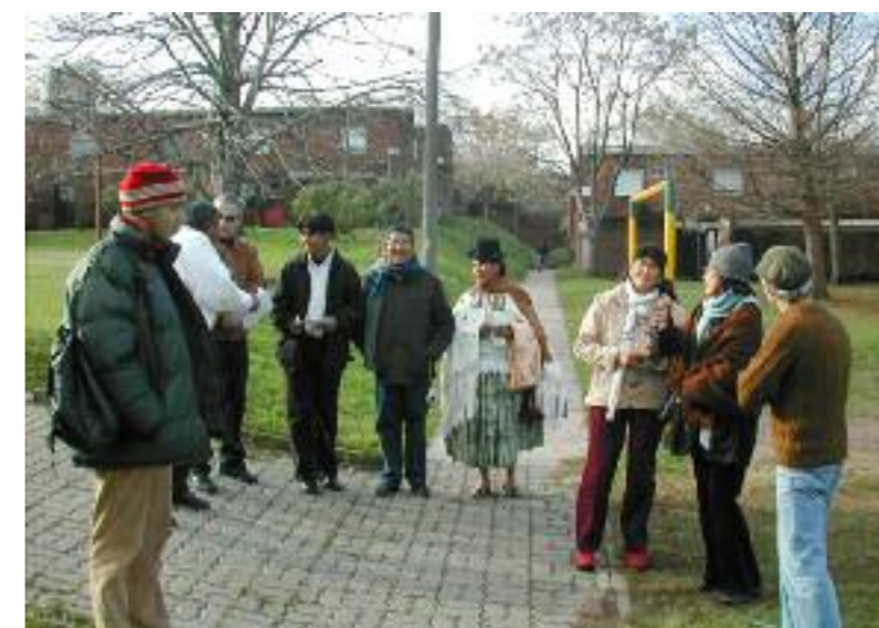
Uruguay – Technical personnel and cooperative members from Bolivia visiting the FUCVAM model