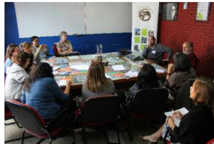
Workshops at the FUCVAM headquarters