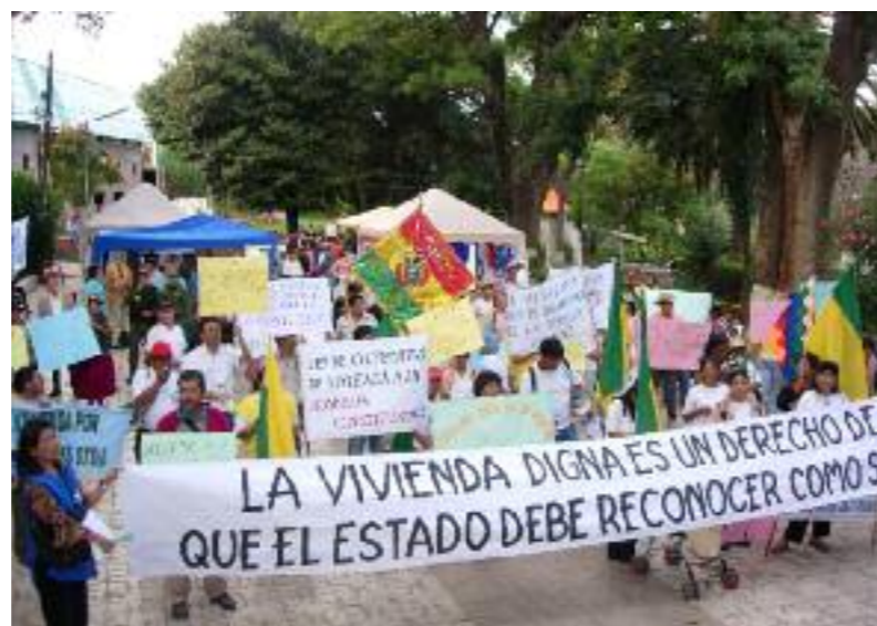
Bolivia – Mobilisation in the streets to defend the right to housing