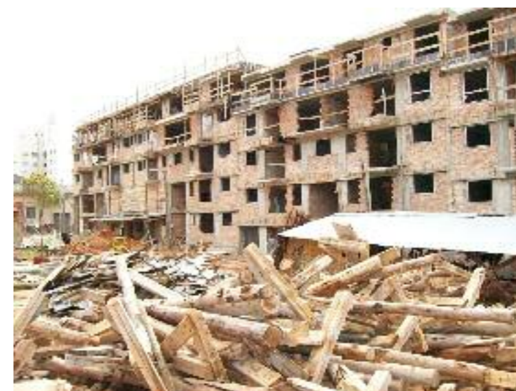
Covireus al Sur demonstrates that mutual aid can be used beyond simple one or two storey houses