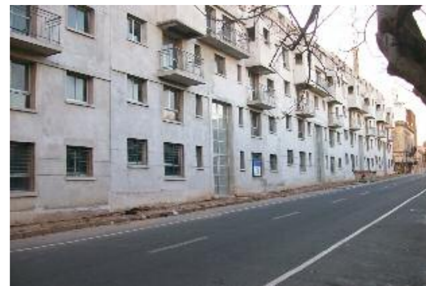
Covireus al Sur cooperative located in the historical centre of Montevideo