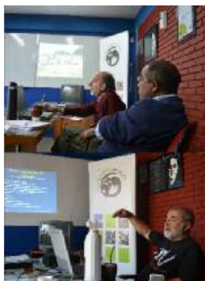
Members of FUCVAM explaining the different characteristics of the model