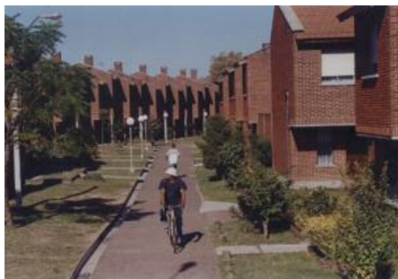
Cofavi 90 cooperative, Montevideo