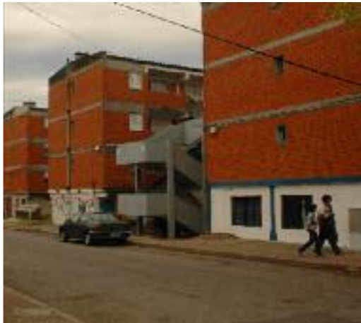
Examples of housing units and wall painting in the Community Centre representing Zona 3.