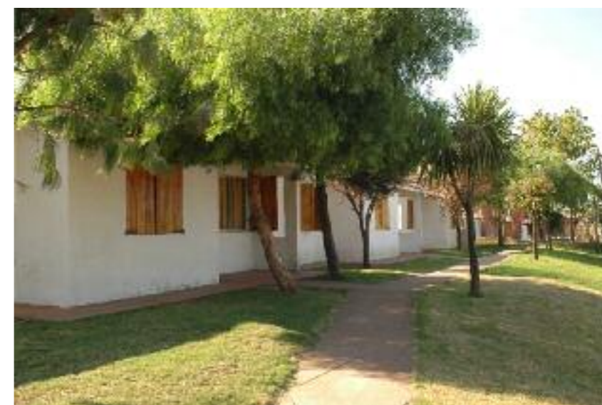
Covimp cooperative – housing development primarily built for and by people with disabilities