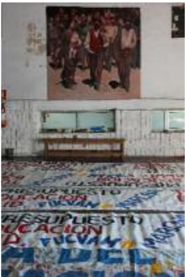
Preparing to march for housing rights