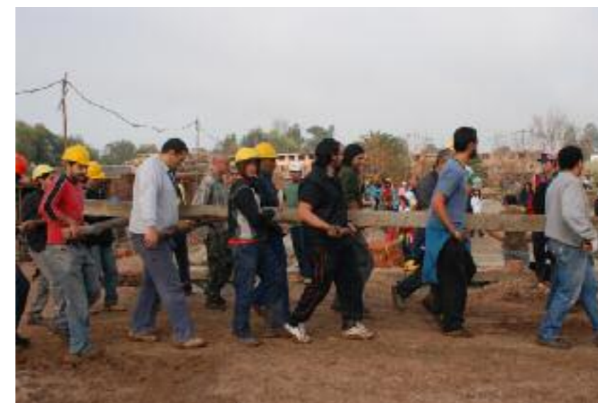
Mutual aid construction during a Solidarity Day