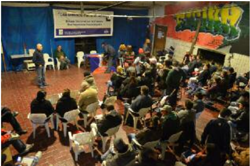
Attending the evening plenary sessions