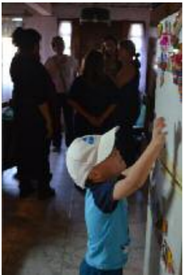
Residents opening their homes to participants