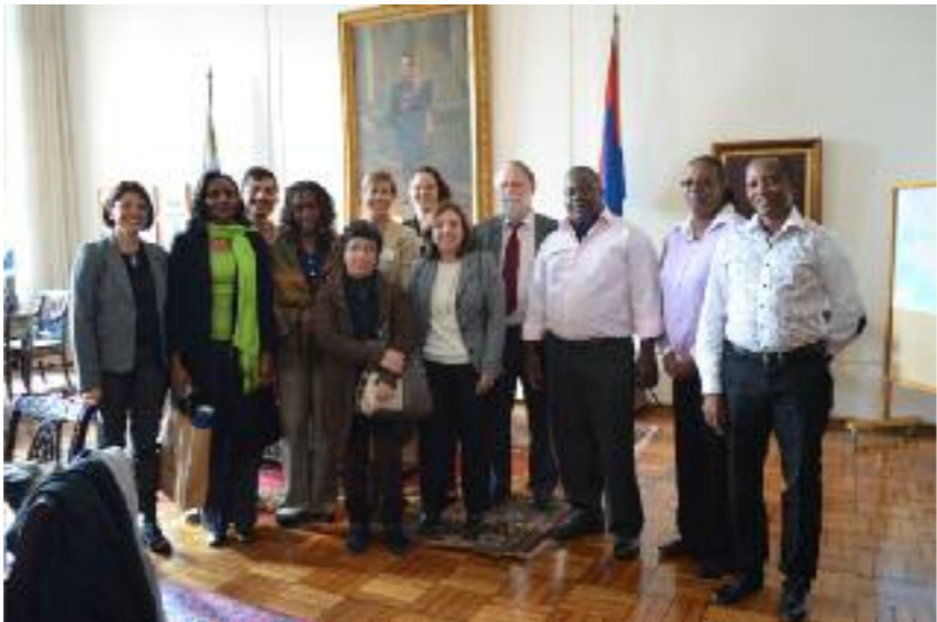
Visit to the office of the Mayor of Montevideo