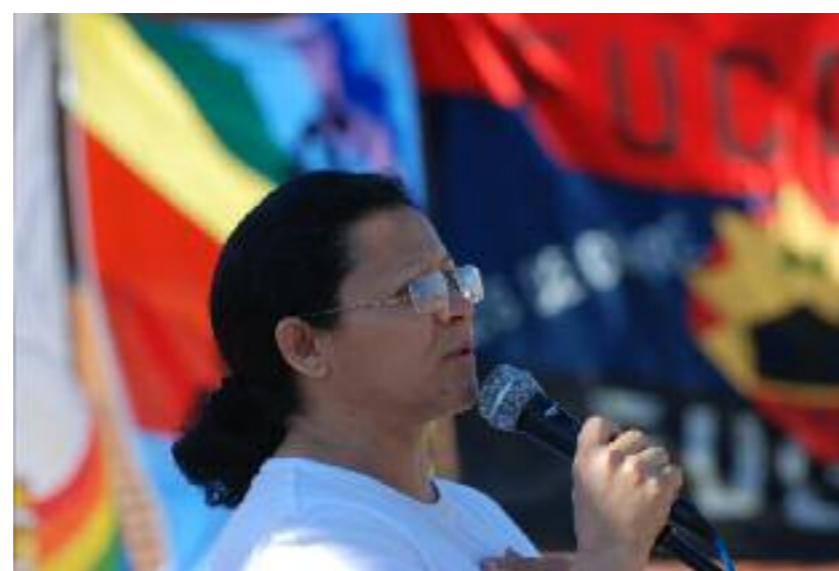
FUCVAM focuses on social mobilisation as a democratic way of involving citizens in the process of urban transformation