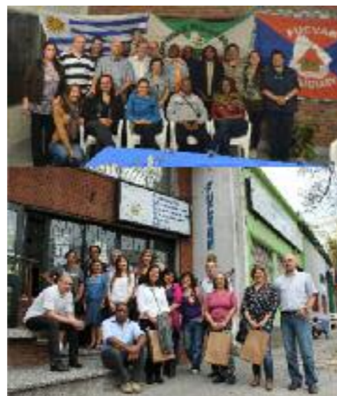
Group photos with the participants – sessions I and II