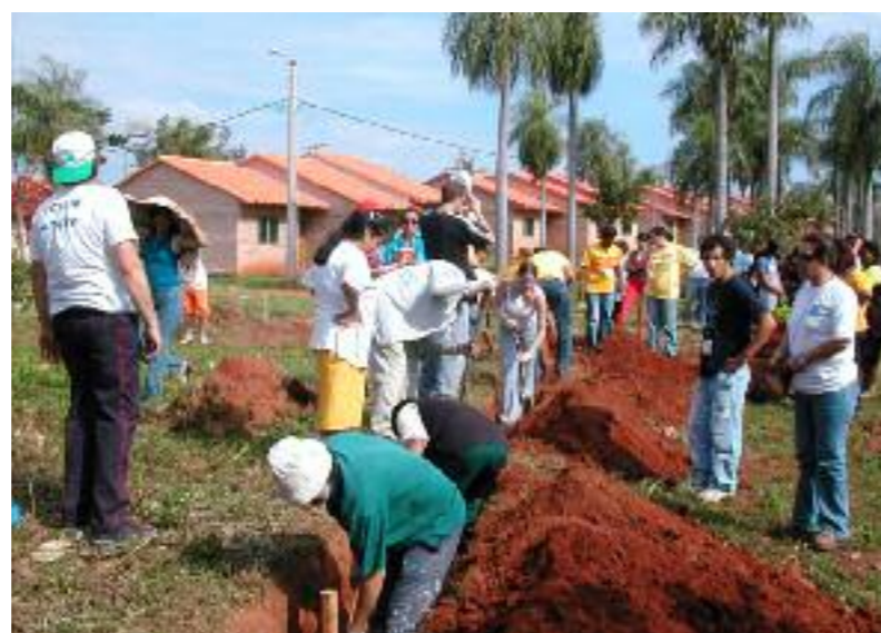
Paraguay – Construction process with the support of a FUCVAM delegation