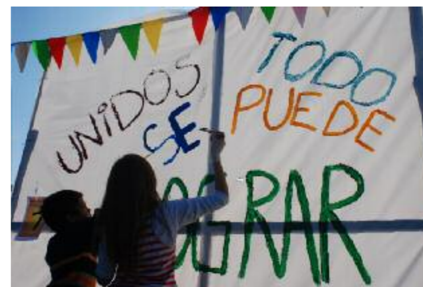
'United we can achieve anything'