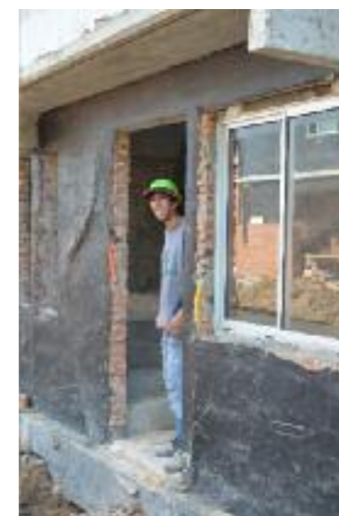
Cooperative member in the construction process