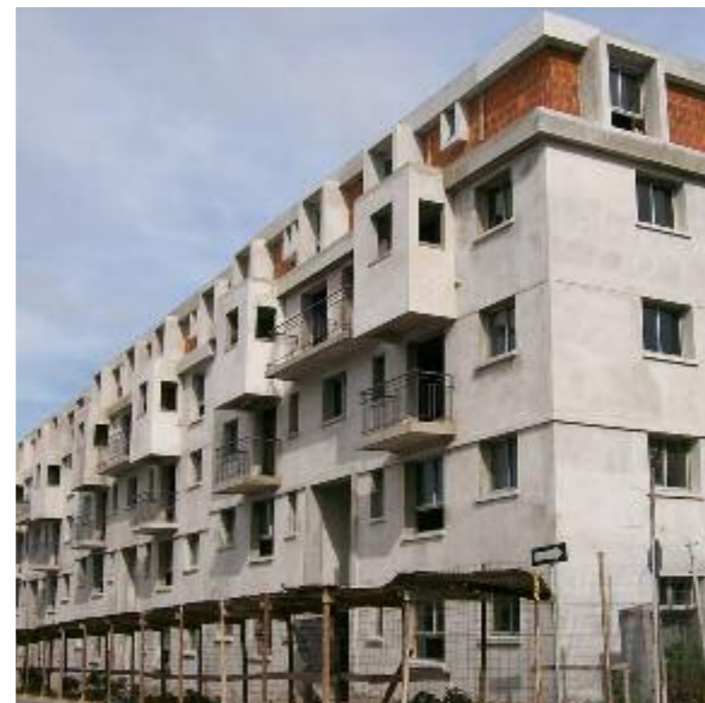
Case Studies: Covireus al Sur