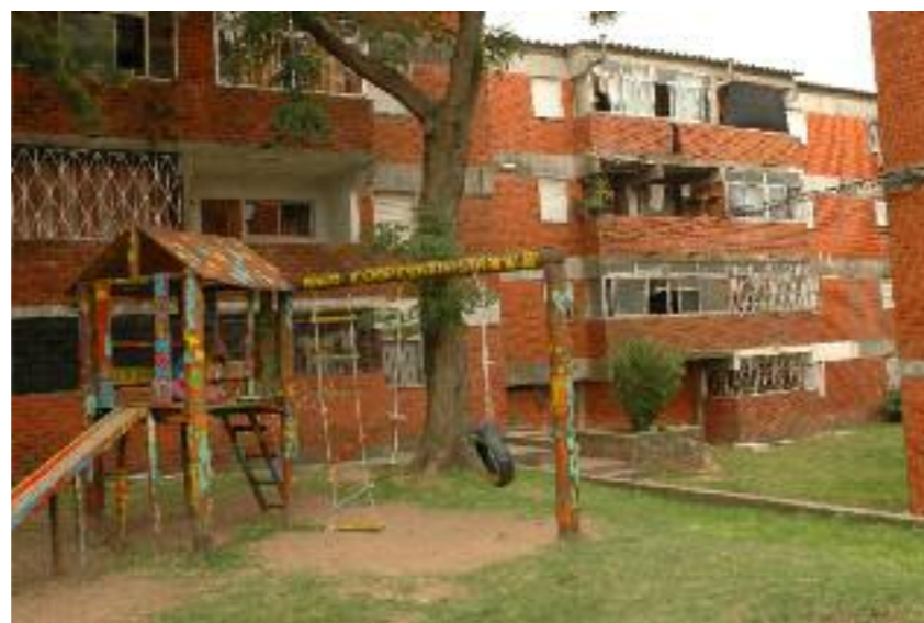
Children's playing area in Zona 3, Montevideo