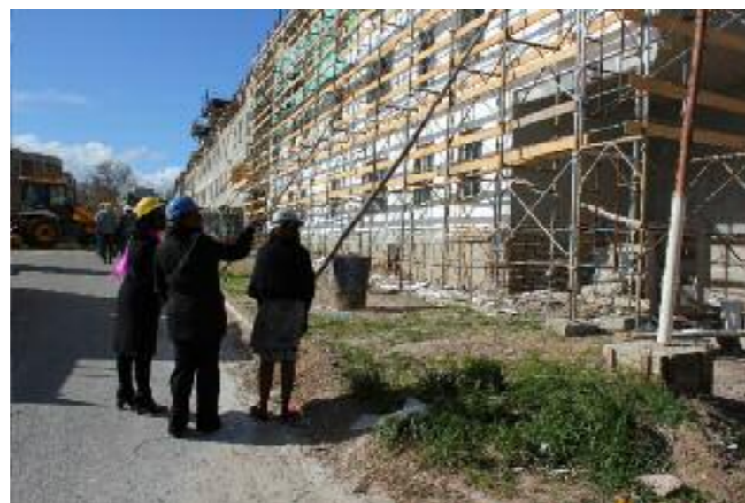
Visit to the construction site of a new multi-storey cooperative