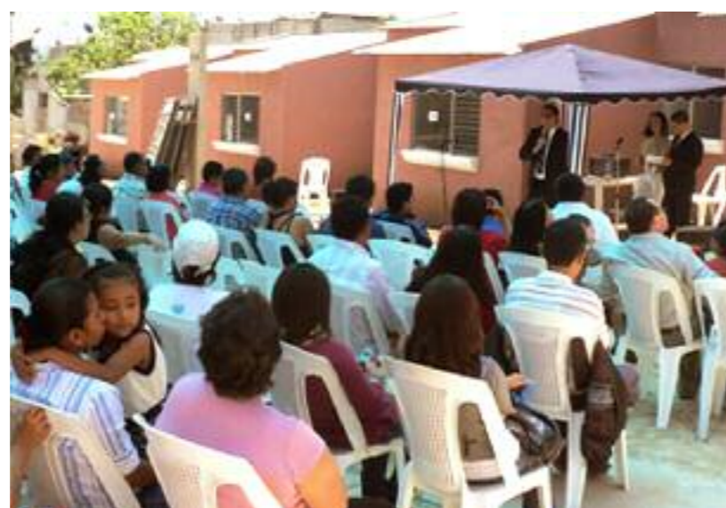
Guatemala – Cooperative members organise a celebration to inaugurate the houses