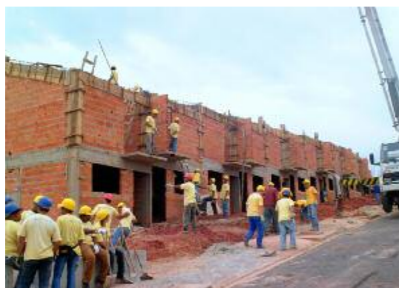
Brazil – Mutual aid construction with technical assistance