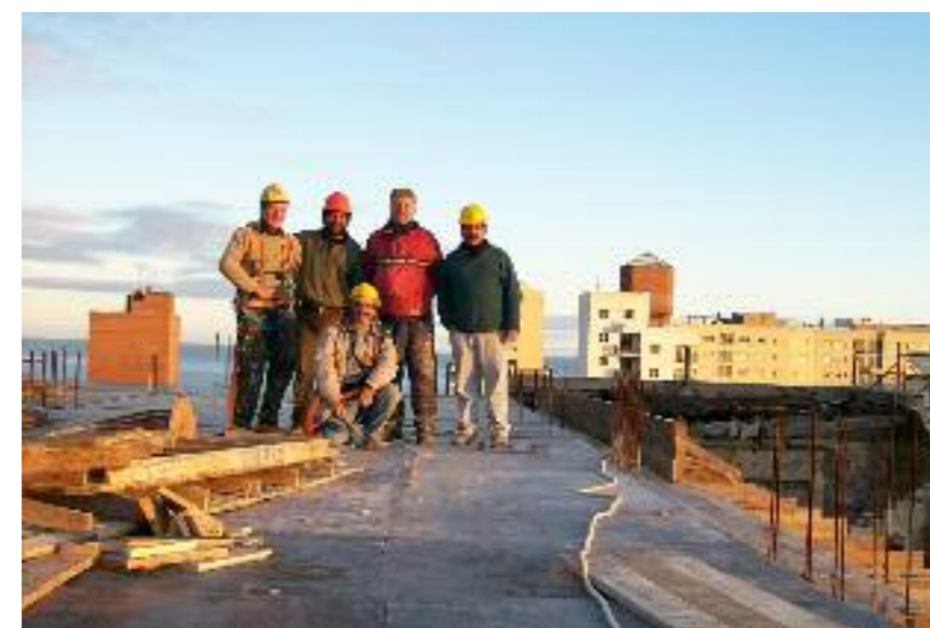
Mutual aid promotes the creation of strong links among future neighbours