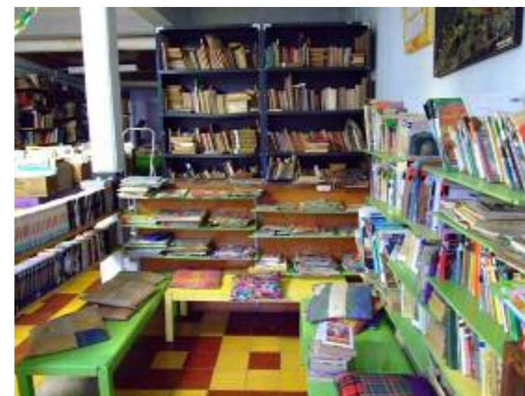
Library in Mesa 5 cooperative, Montevideo