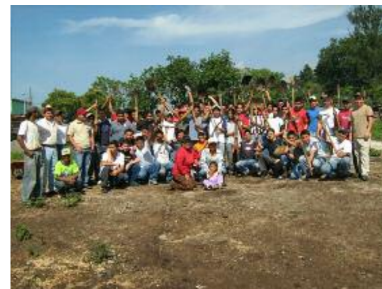
Guatemala – Students at the Solidarity Day in Guatemala City