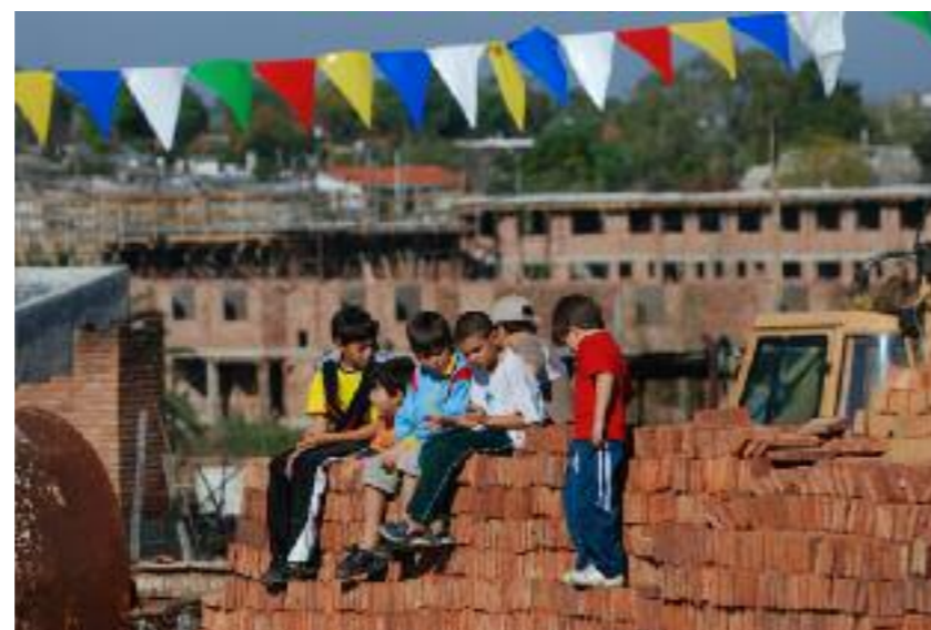
Cooperativism as a way of life involving all generations