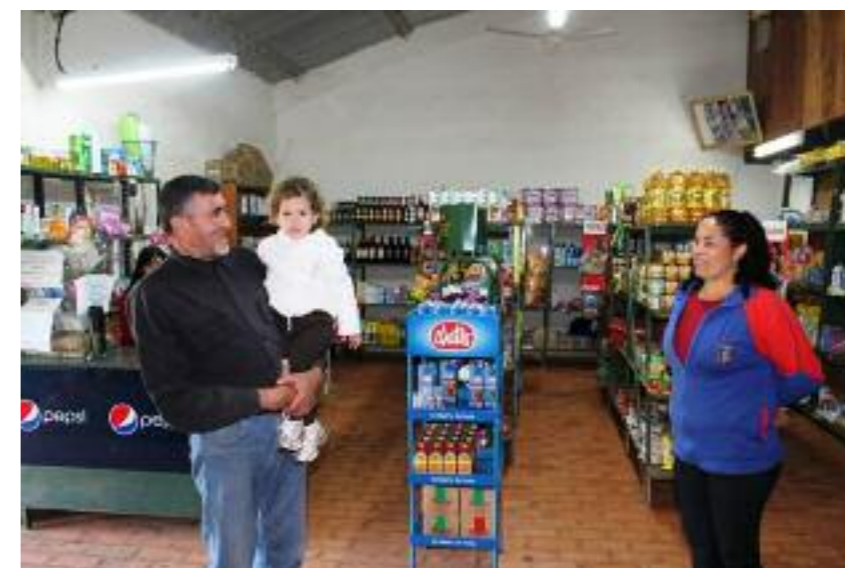
Paraguay – Example of business forming part of the Paraguayan 'multi-active' cooperative housing model