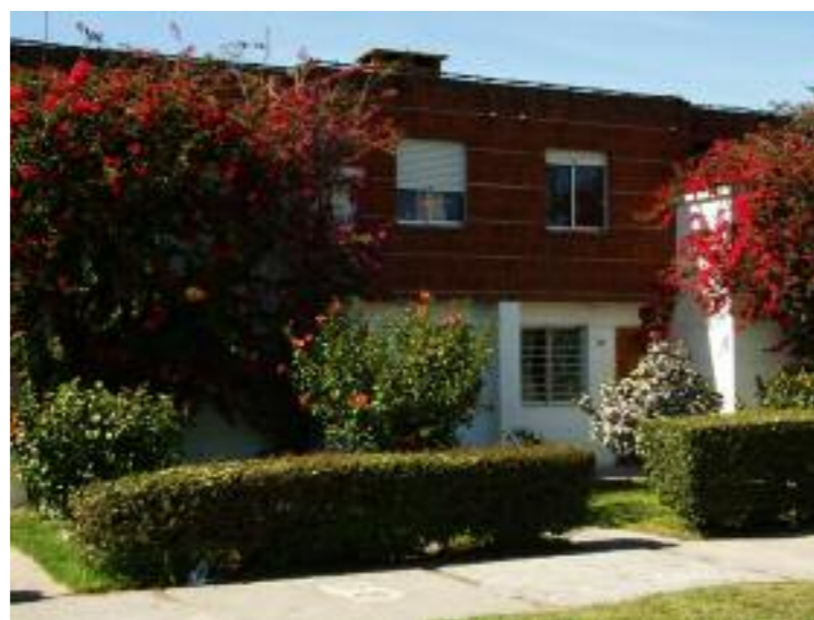
Covitea cooperative, two storey building, Montevideo