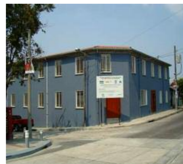
El Salvador – Urban rehabilitation in the Historical Centre of San Salvador