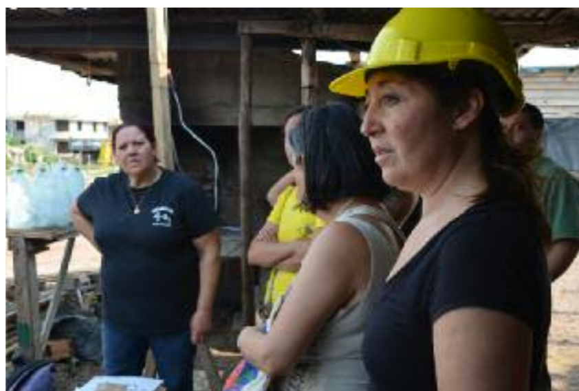
Cooperative members explain the construction and its management