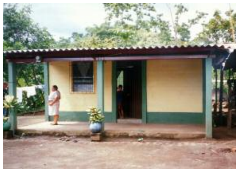
El Salvador – Rural Housing Cooperative Heroes de Piedra Roja