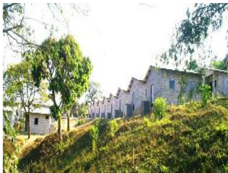
Honduras – Casa de Oro Cooperative in El Paraíso