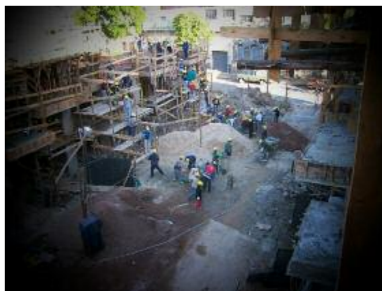
Construction process in Covireus al Sur after original decaying structures have been demolished, Montevideo