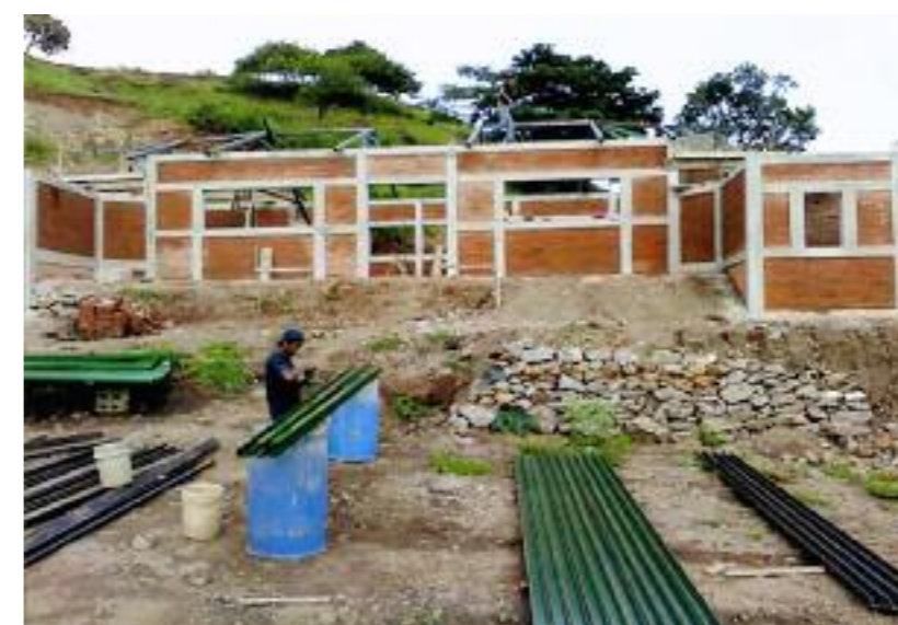
Nicaragua – Housing cooperative under construction