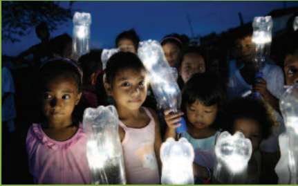
Solar nightlights in Leyte, one of the areas affected by Typhoon Haiyan