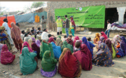
Volunteers train rural women in safe building techniques