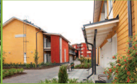
Supported housing for people recovering from mental health problems