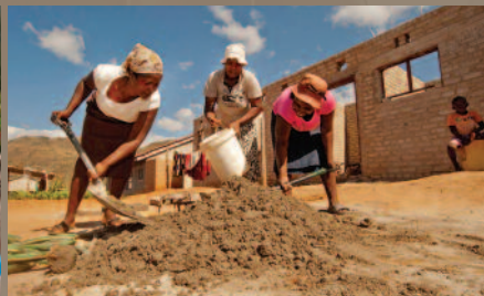
Members of the all-female 'Miracle Group' cast bricks for construction, Zimbabwe