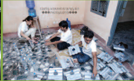
Building and installing bottle daylightlights