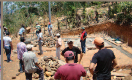
Training in housebuilding using reinforced adobe