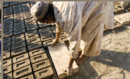
Good quality bricks are the cornerstone of safe building