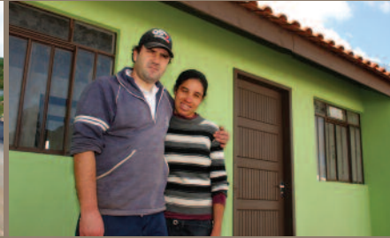
Residents outside their new home