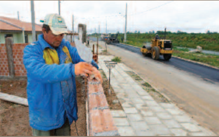
Resident building the wall of the family house