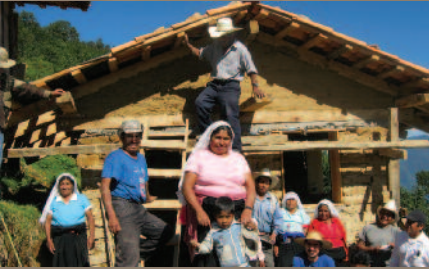
Training workshop on mud plastering

SPECIAL COMMENDATION FROM BSHF FOR OUTSTANDING ACHIEVEMENTS IN CHALLENGING CIRCUMSTANCES