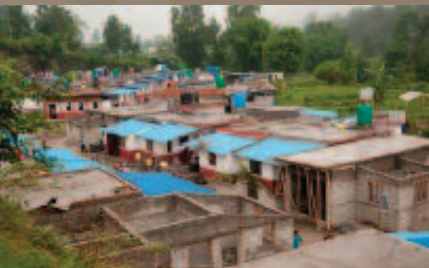
Bio-gas mini-grid ensures 24 hour street lighting, Nepal