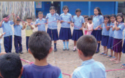
Education programme for children