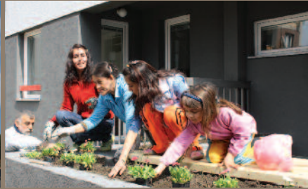
Community organised landscape improvement