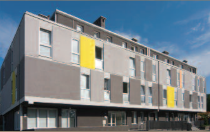
SHSE building with 20 apartments in Belgrade