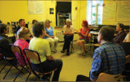
Volunteer psychologist running an art-therapy class

SPECIAL COMMENDATION FROM BSHF FOR OUTSTANDING ACHIEVEMENTS IN CHALLENGING CIRCUMSTANCES