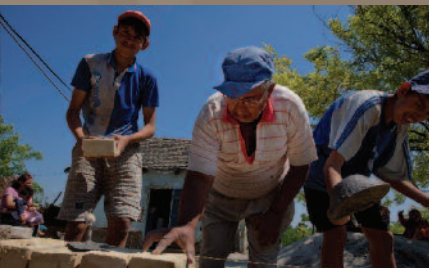
Family employing a local bricklayer