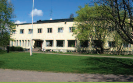
Supported housing for homeless young people