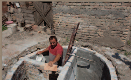
Bricklaying septic tank