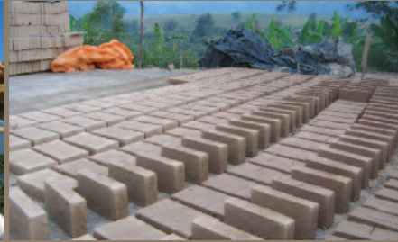
The community casts the adobe bricks used for construction